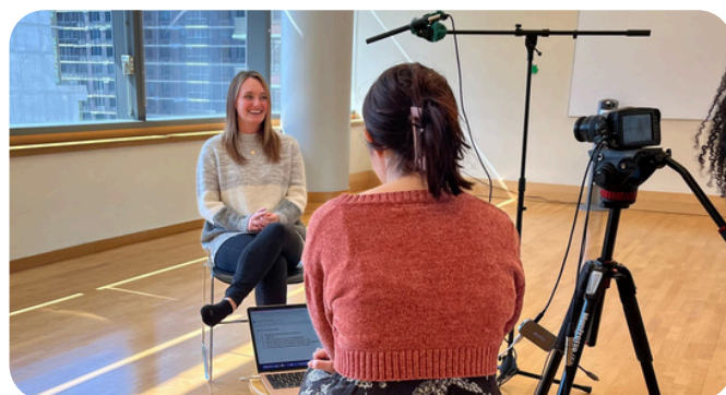
Resurrection Life NYC | New York, NY

Young adults at this church chose to partner with a local youth center to host a Cinco de Mayo celebration during their town's First Fridays event. By working with the youth center, the team shared they not only extended their outreach to the community but also furthers their goal of living out their young adult ministry mission to "go and make disciples."