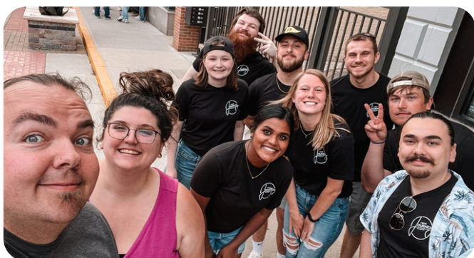
New Journey Community Church | Wabash, Indiana

Young adults at this church chose to partner with a local youth center to host a Cinco de Mayo celebration during their town's First Fridays event. By working with the youth center, the team shared they not only extended their outreach to the community but also furthers their goal of living out their young adult ministry mission to "go and make disciples."